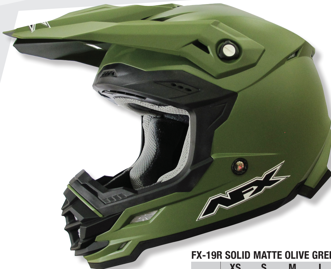
FX-19R SOLID MATTE OLIVE GREEN