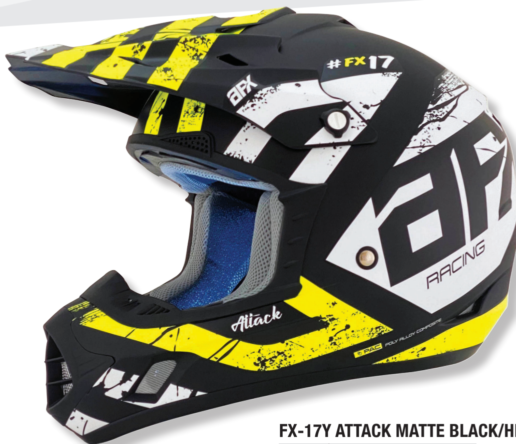
FX-17Y ATTACK MATTE BLACK/HI-VIS YELLOW