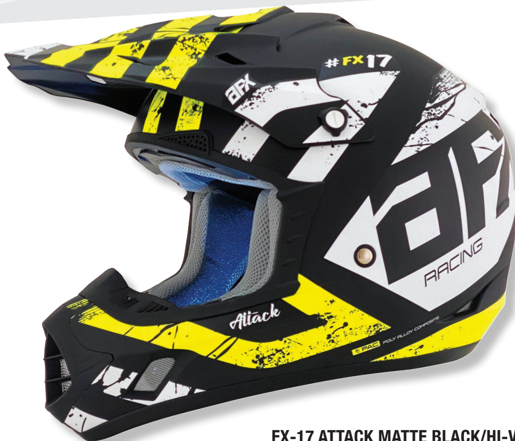
FX-17 ATTACK MATTE BLACK/HI-VIS YELLOW