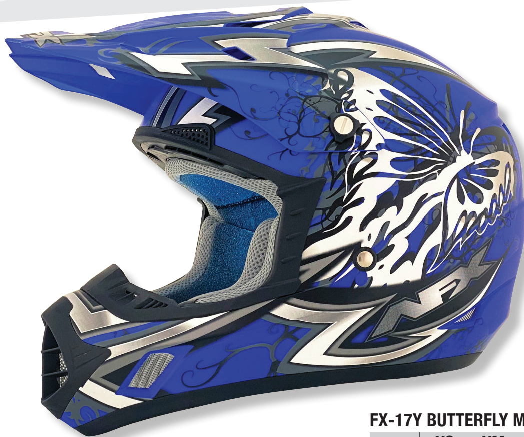
FX-17Y BUTTERFLY MATTE BLUE