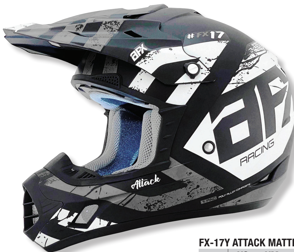
FX-17Y ATTACK MATTE BLACK/SILVER