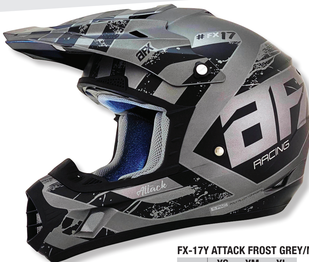
FX-17Y ATTACK FROST GREY/MATTE BLACK