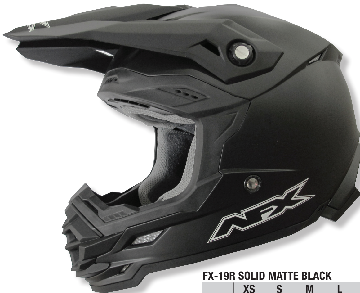
FX-19R SOLID MATTE BLACK