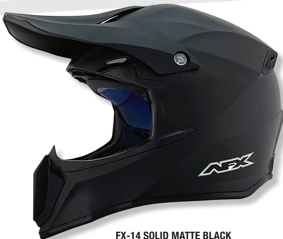
FX-14 SOLID MATTE BLACK