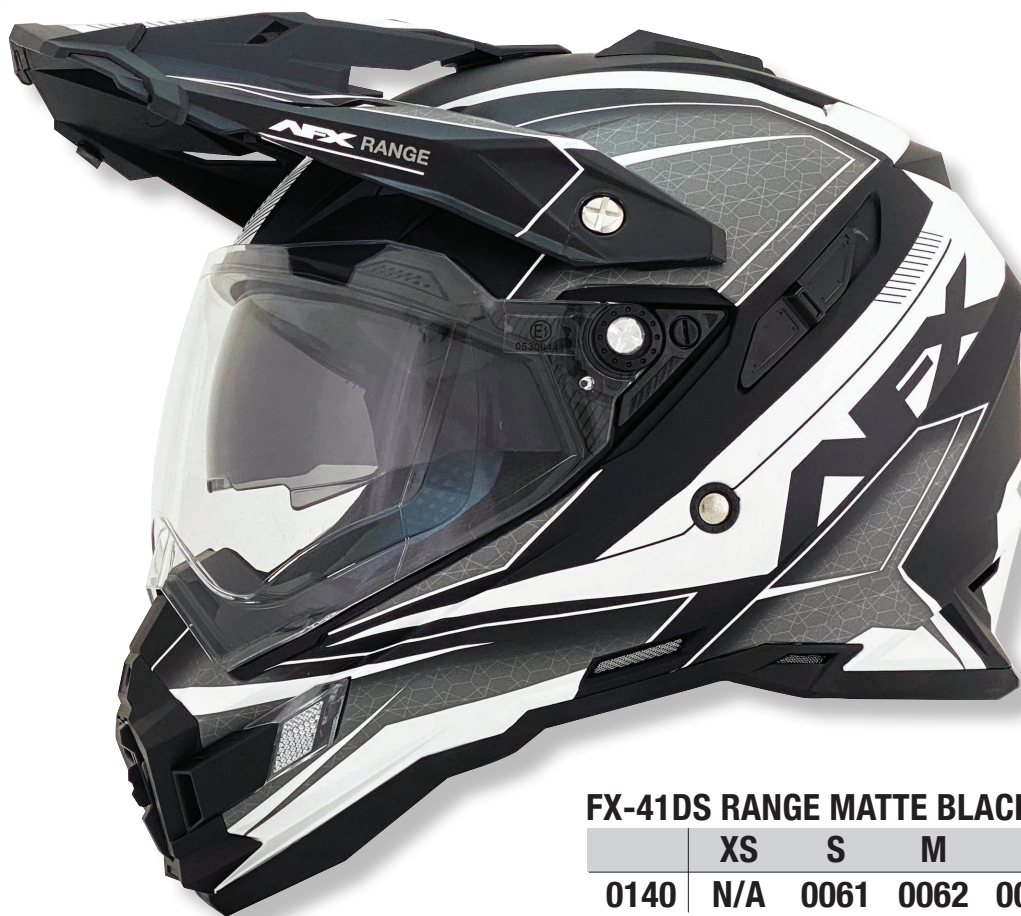
FX-41DS RANGE MATTE BLACK