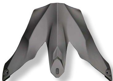
FX-14 PEAK MATTE BLACK PART NUMBER :0132-1465