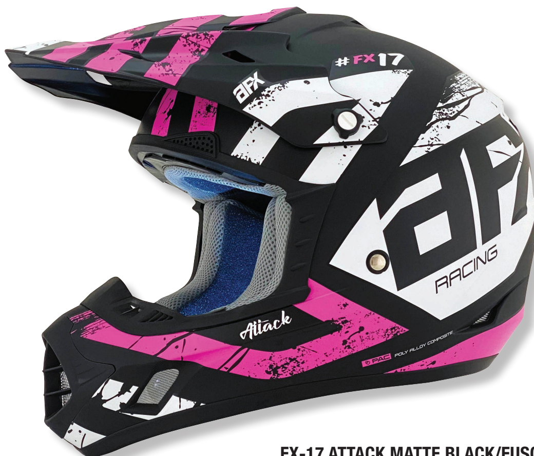
FX-17 ATTACK MATTE BLACK/FUSCHIA