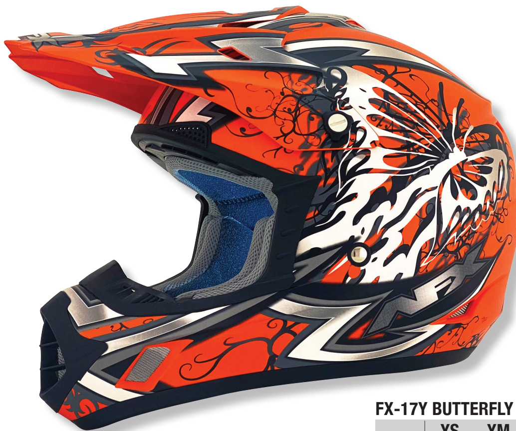
FX-17Y BUTTERFLY MATTE ORANGE