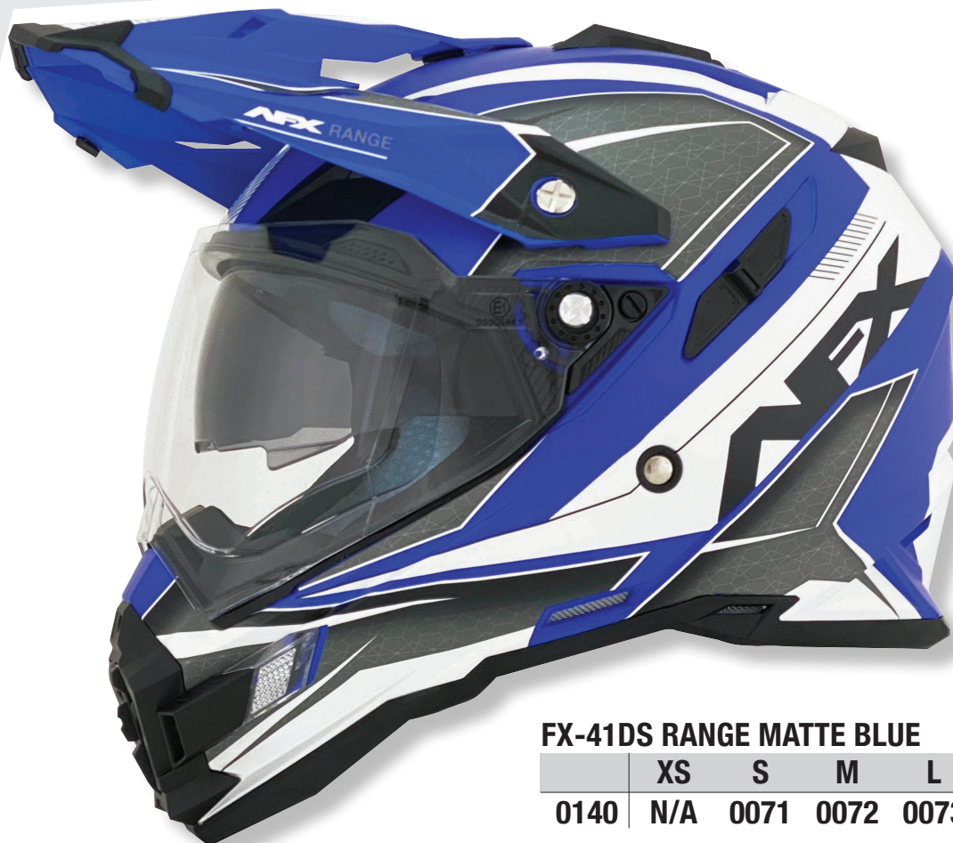
FX-41DS RANGE MATTE BLUE