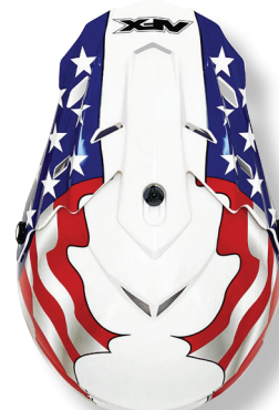
FX-17 FREEDOM / WHITE