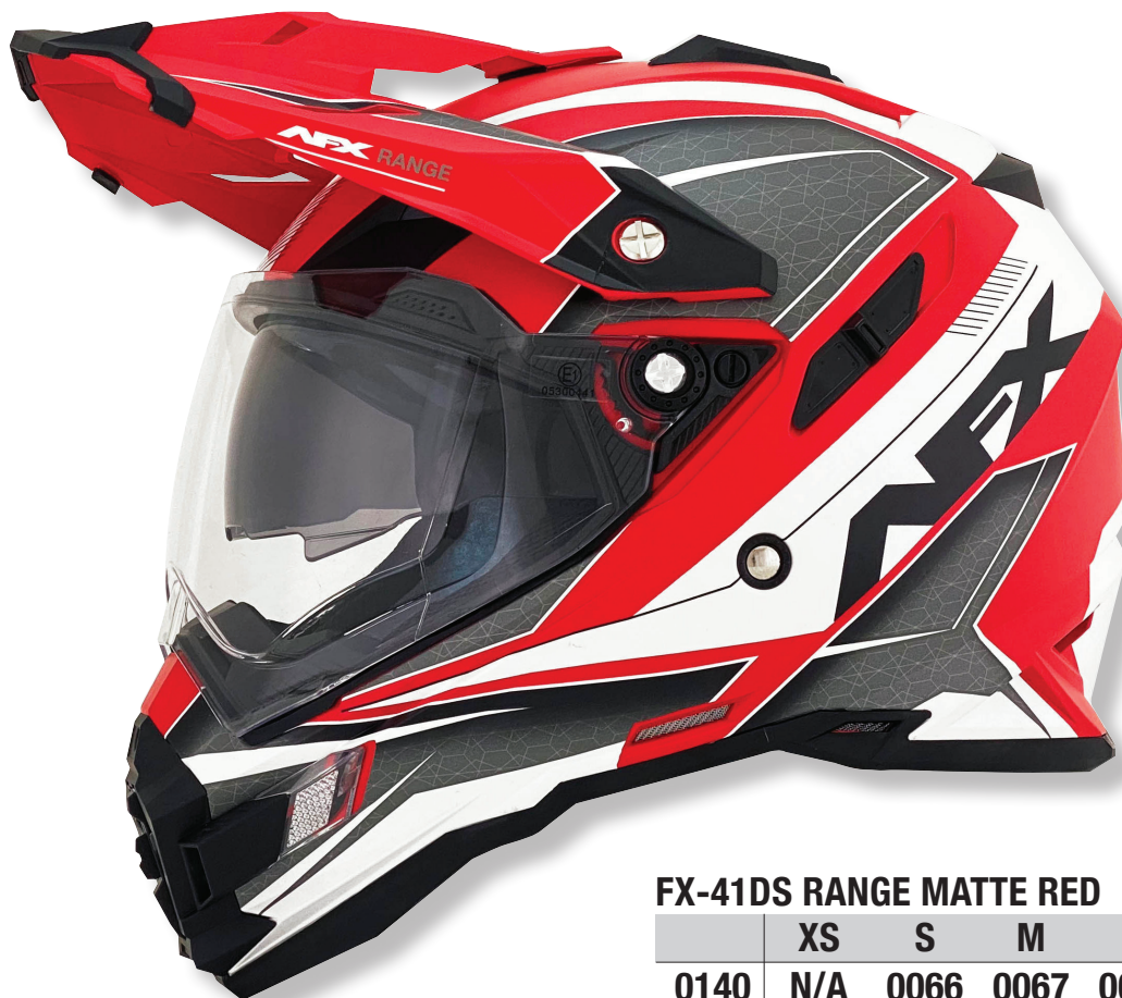
FX-41DS RANGE MATTE RED