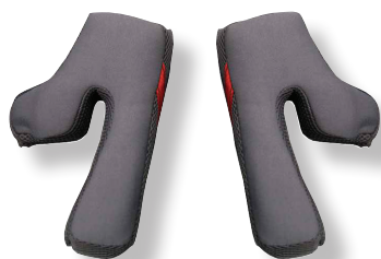
FX-14 CHEEK PADS