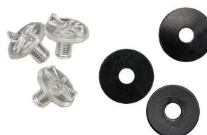
FX-14 SCREWS PEAK PART NUMBER :0132-1297