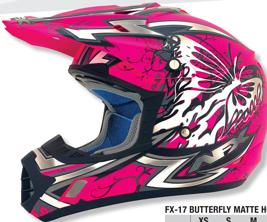
FX-17 BUTTERFLY MATTE HOT PINK