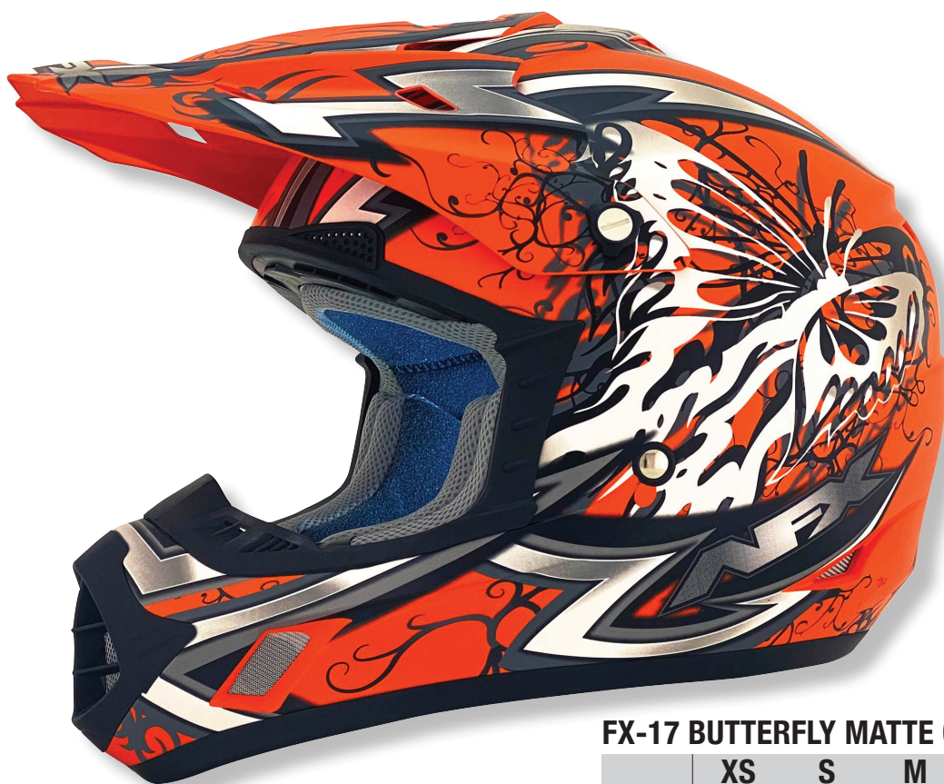
FX-17 BUTTERFLY MATTE ORANGE