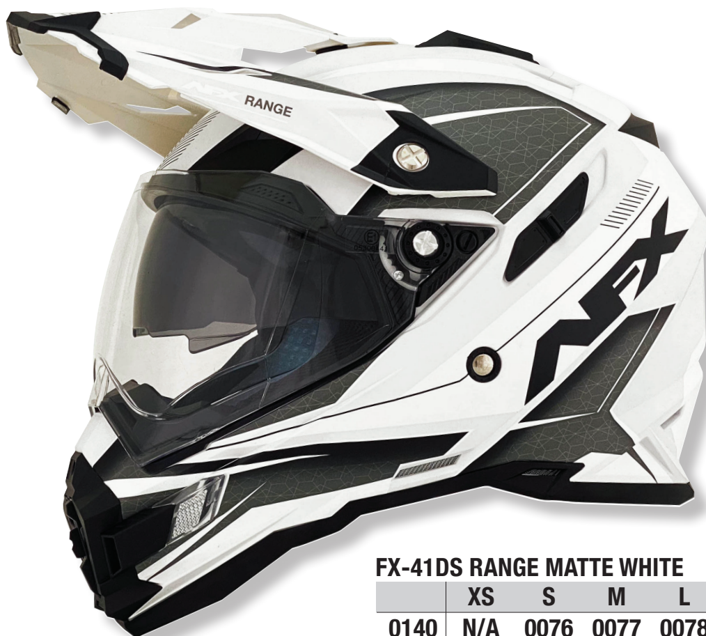
FX-41DS RANGE MATTE WHITE