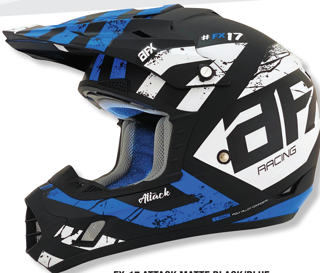
FX-17 ATTACK MATTE BLACK/BLUE