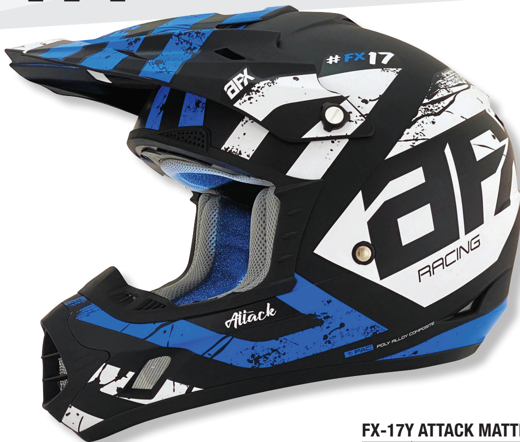
FX-17Y ATTACK MATTE BLACK/BLUE