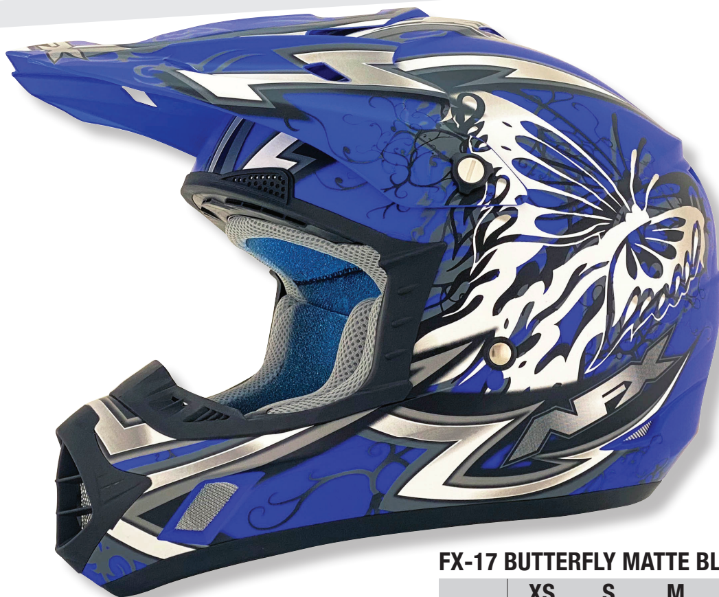
FX-17 BUTTERFLY MATTE BLUE