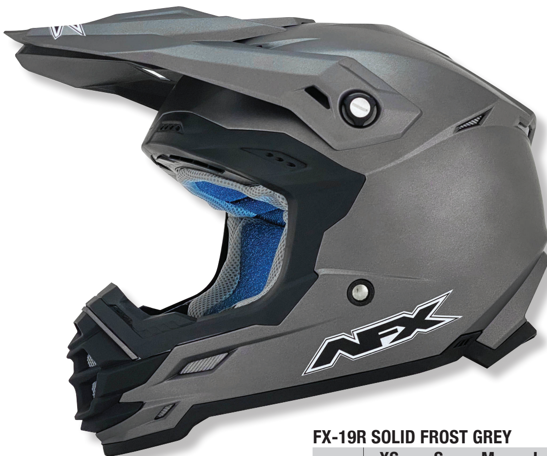
FX-19R SOLID FROST GREY