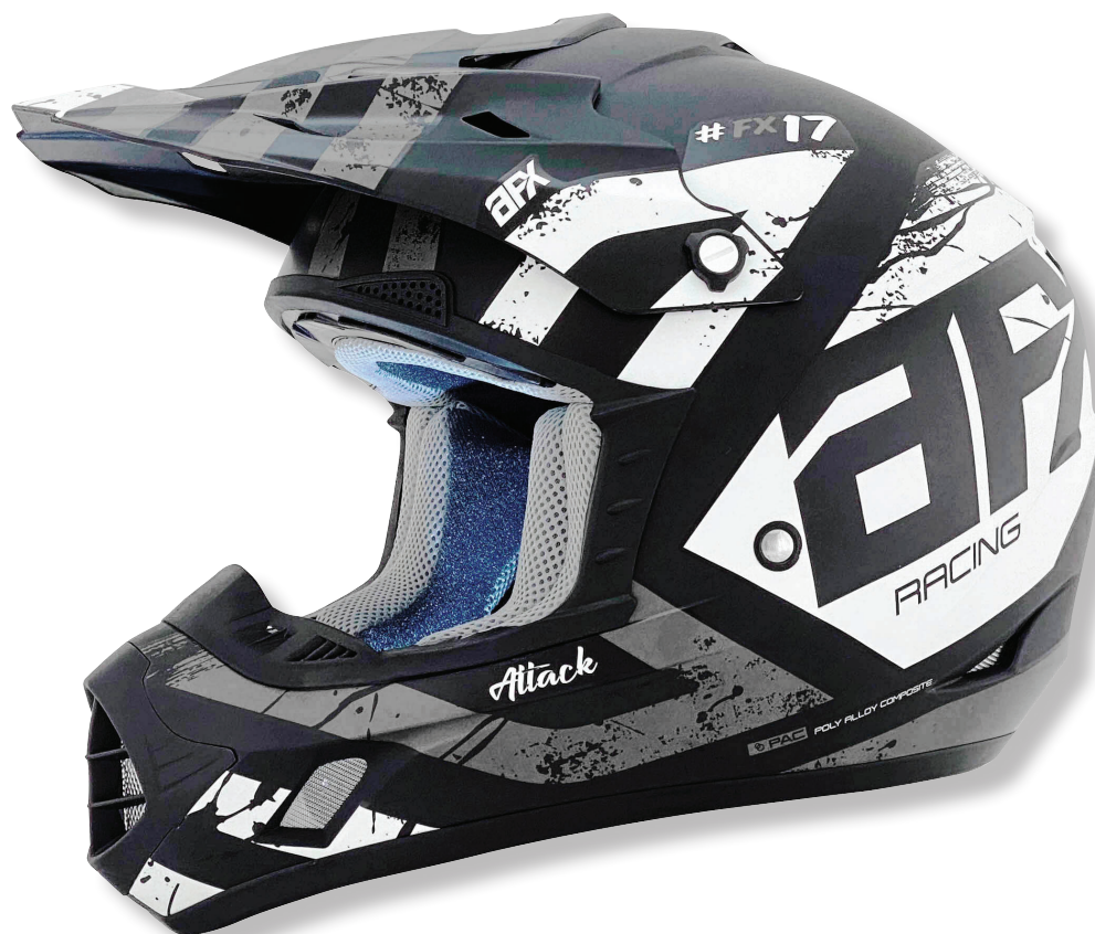
FX-17 ATTACK MATTE BLACK/SILVER