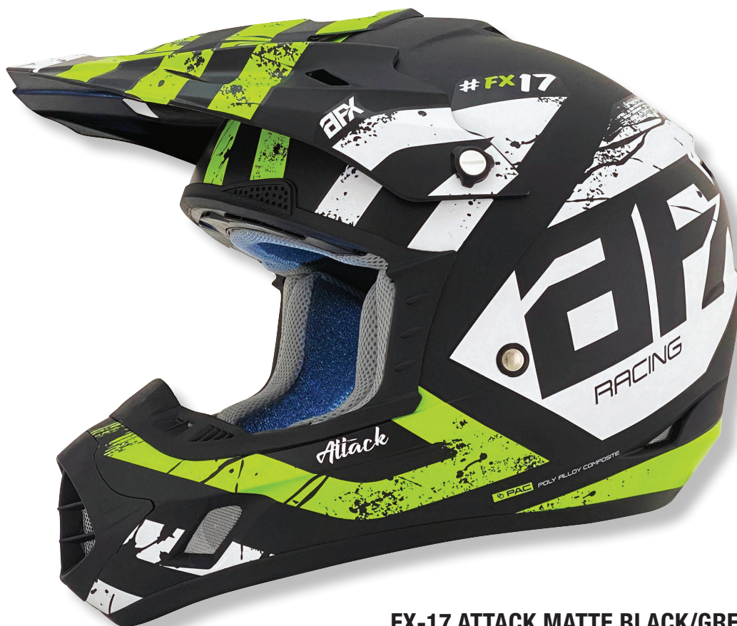
FX-17 ATTACK MATTE BLACK/GREEN