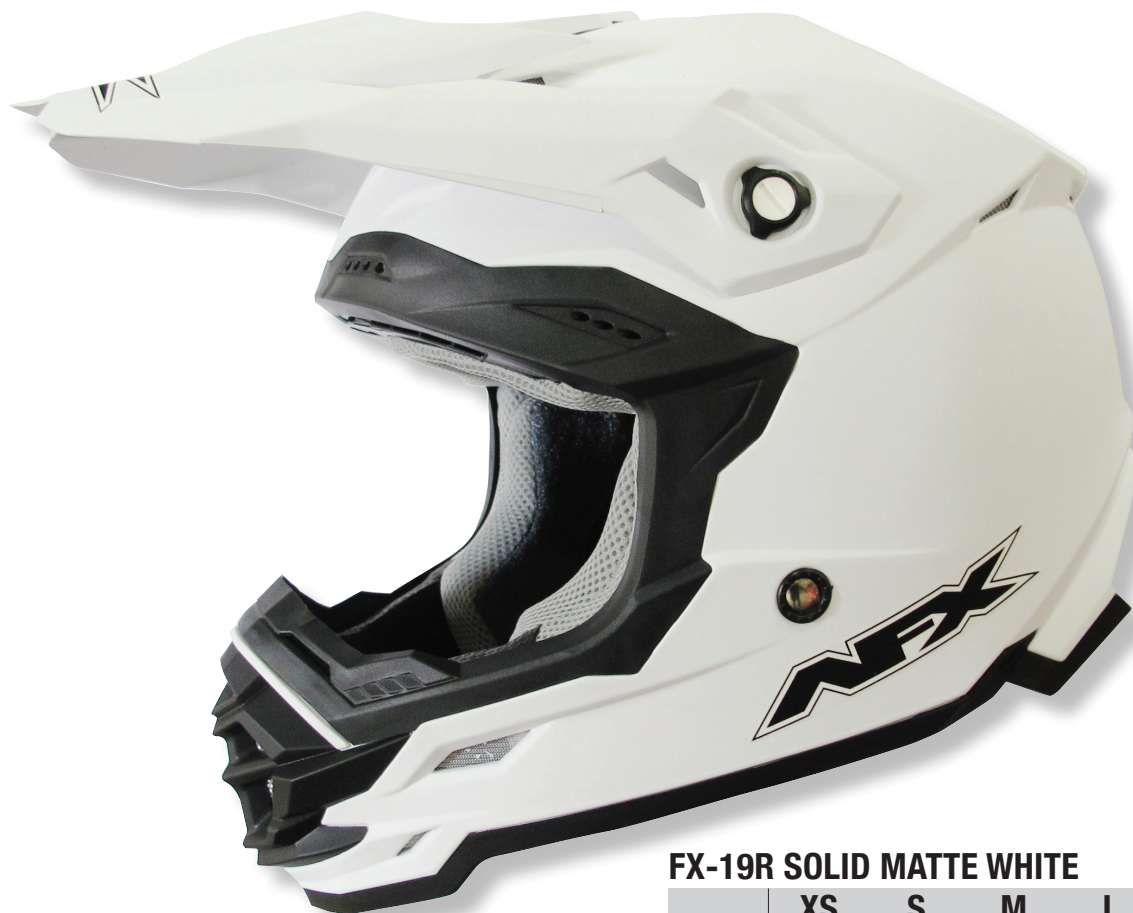
FX-19R SOLID MATTE WHITE