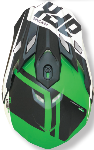
FX-19R RACING MATTE GREEN