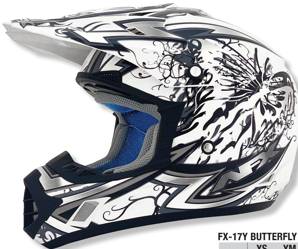
FX-17Y BUTTERFLY MATTE WHITE