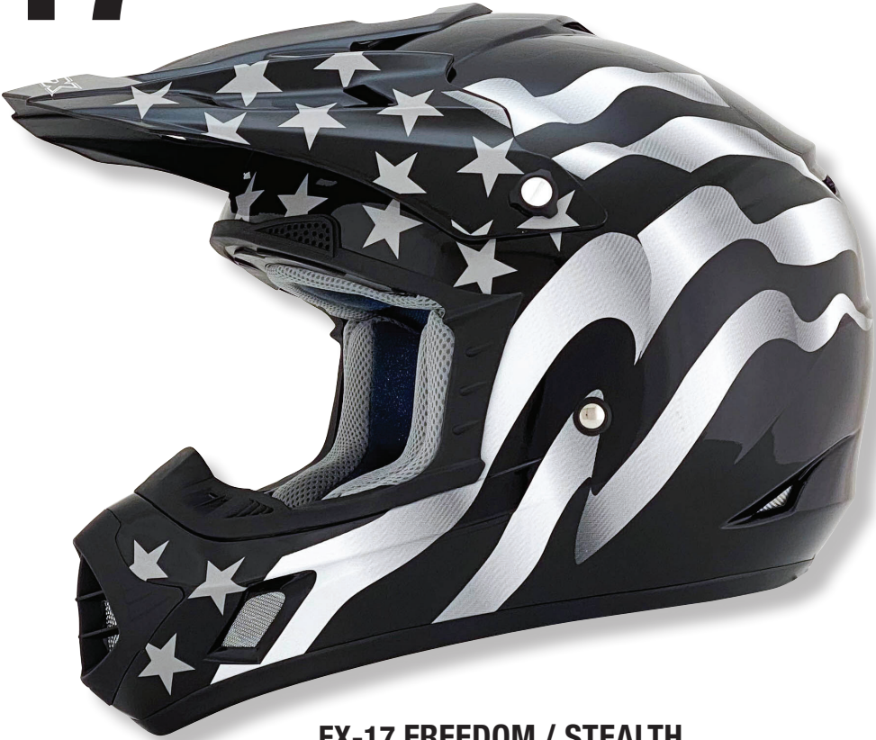
FX-17 FREEDOM / STEALTH