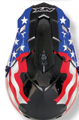
FX-17 FREEDOM / BLACK