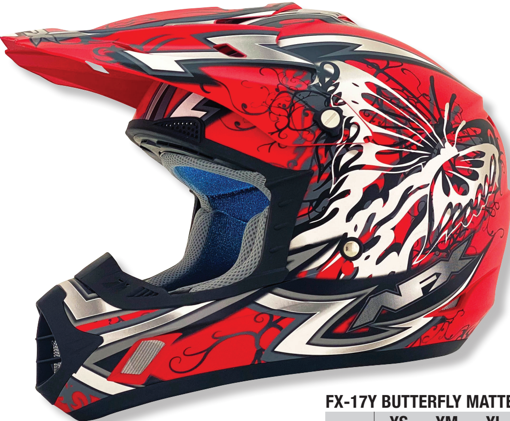
FX-17Y BUTTERFLY MATTE FERRARI RED