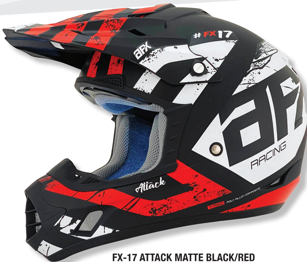
FX-17 ATTACK MATTE BLACK/RED