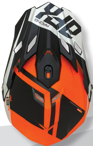
FX-19R RACING MATTE NEON ORANGE