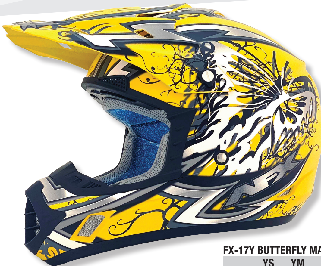
FX-17Y BUTTERFLY MATTE YELLOW