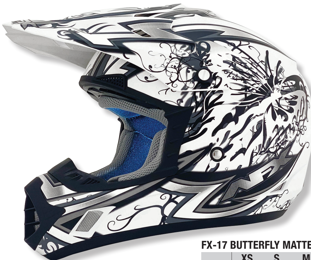
FX-17 BUTTERFLY MATTE WHITE