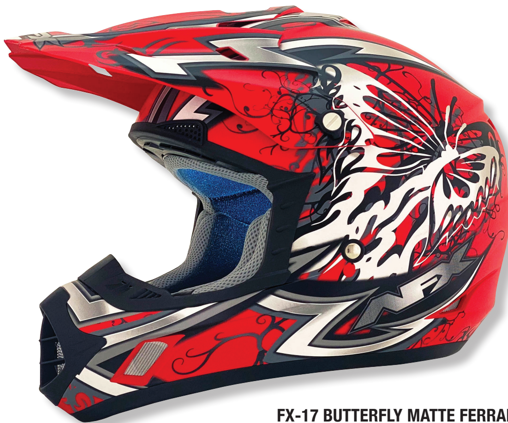
FX-17 BUTTERFLY MATTE FERRARI RED