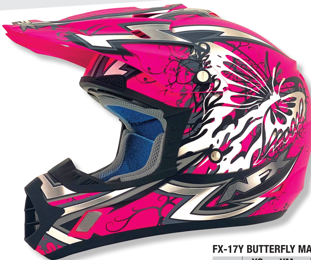
FX-17Y BUTTERFLY MATTE HOT PINK