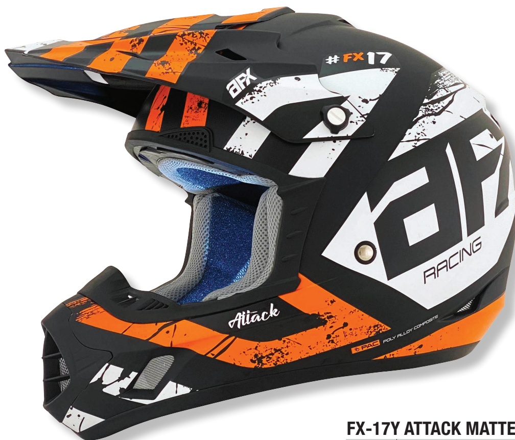
FX-17Y ATTACK MATTE BLACK/ORANGE