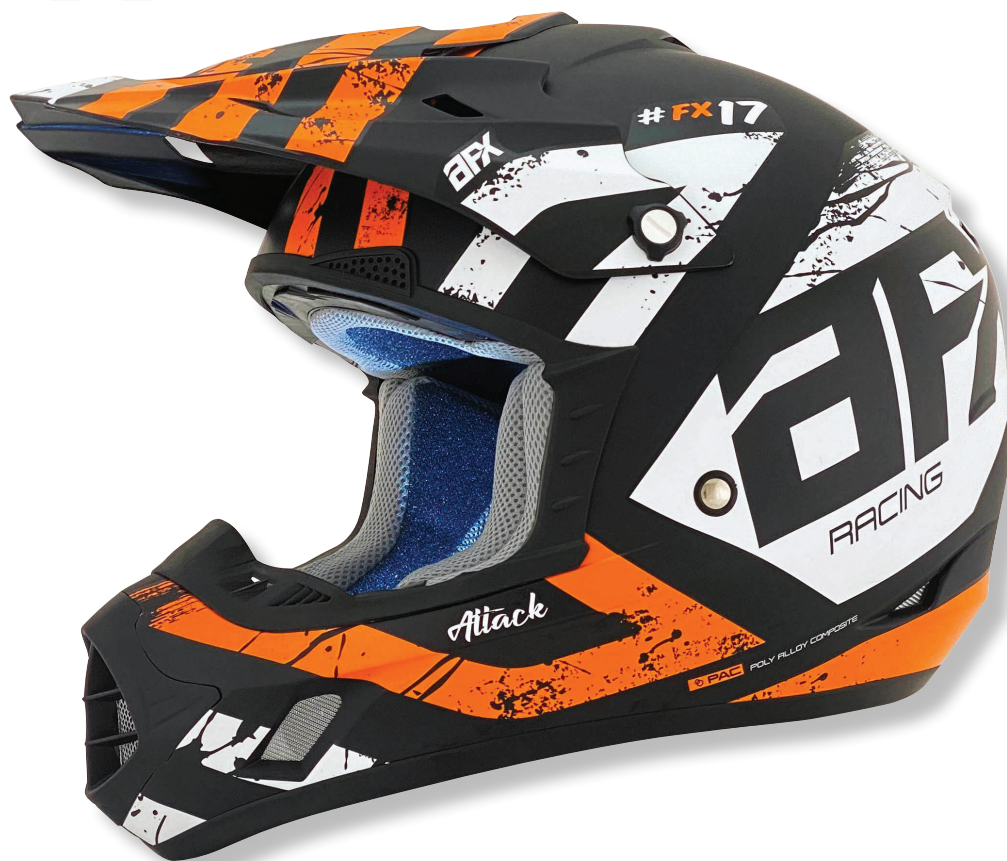
FX-17 ATTACK MATTE BLACK/ORANGE