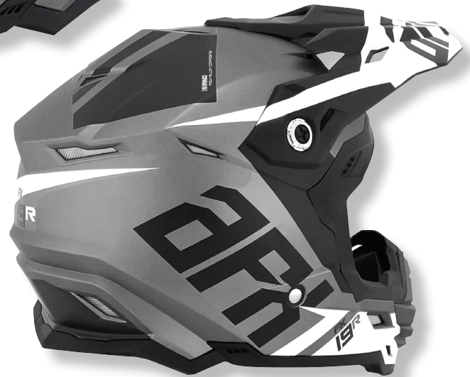
FX-19R RACING FROST GREY