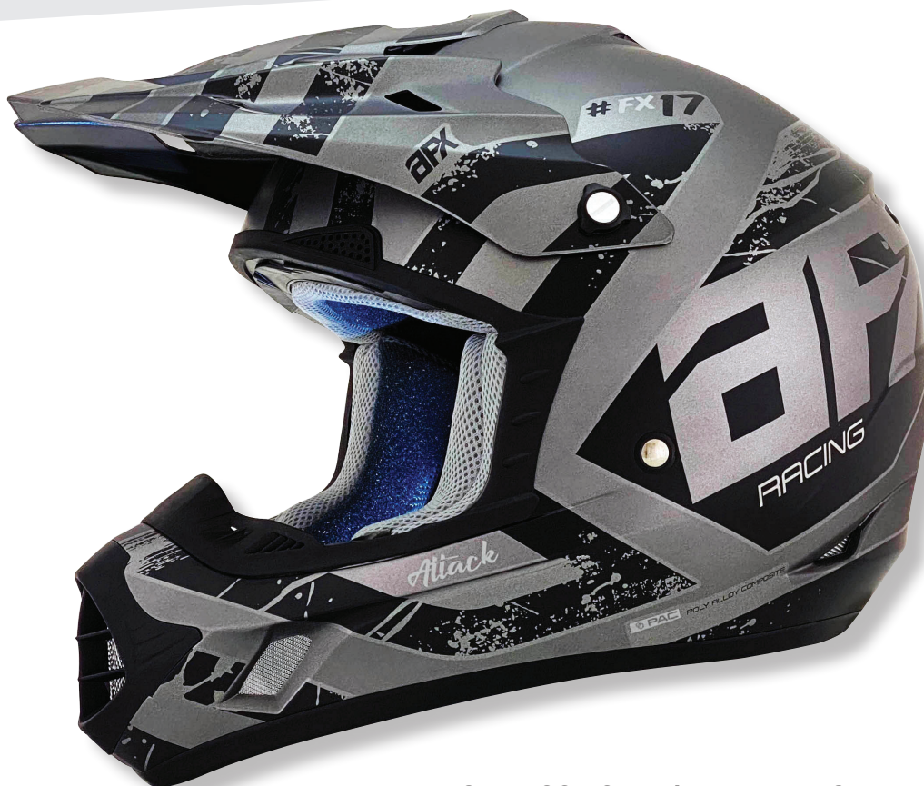
FX-17 ATTACK FROST GREY/MATTE BLACK