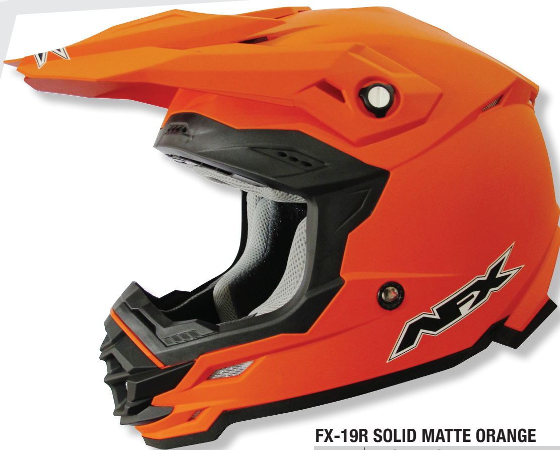
FX-19R SOLID MATTE ORANGE