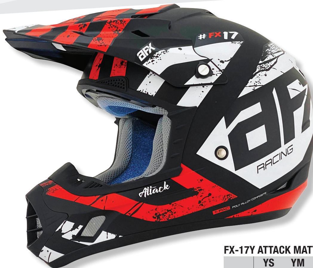
FX-17Y ATTACK MATTE BLACK/RED