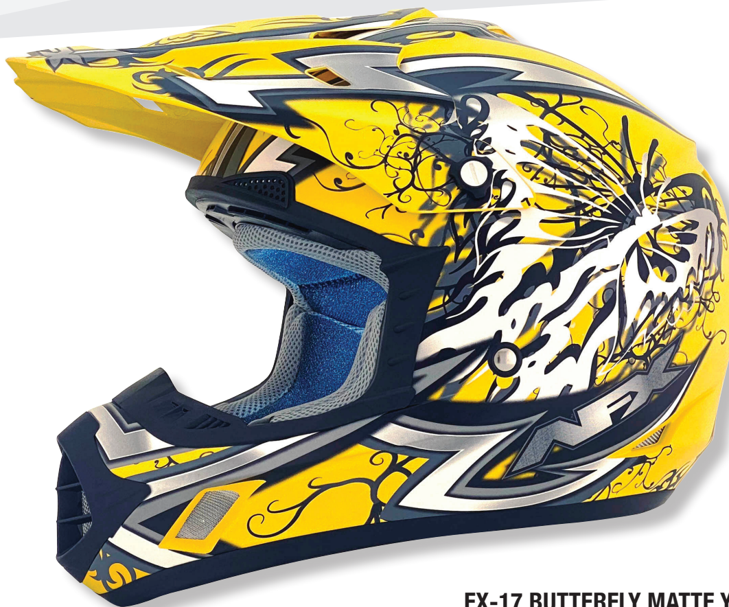
FX-17 BUTTERFLY MATTE YELLOW