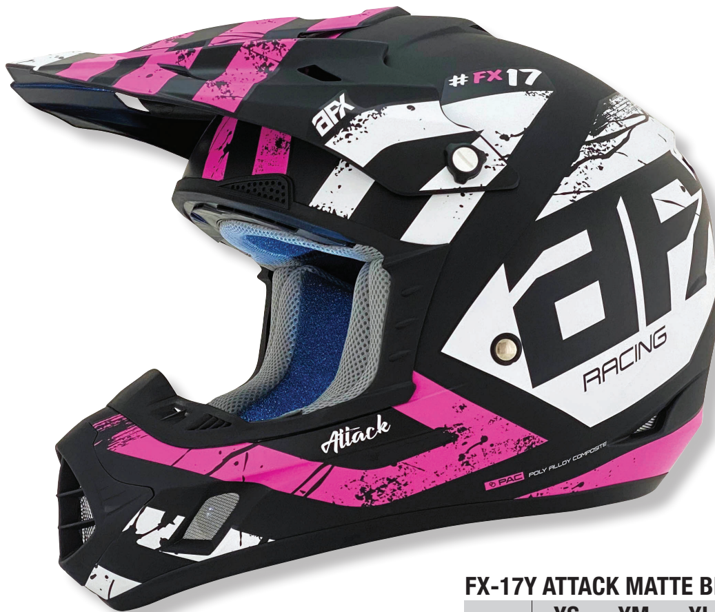
FX-17Y ATTACK MATTE BLACK/FUSCHIA