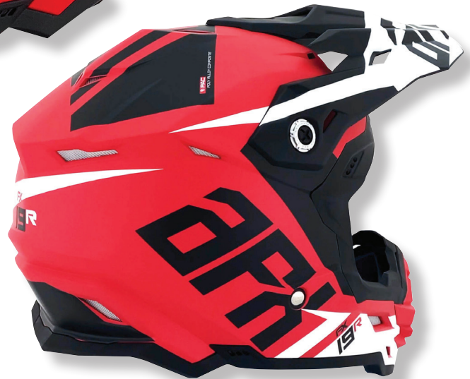
FX-19R RACING MATTE FERRARI RED