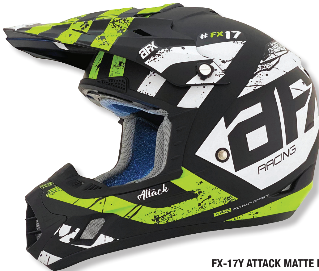
FX-17Y ATTACK MATTE BLACK/GREEN