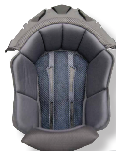
FX-14 COMFORT LINER