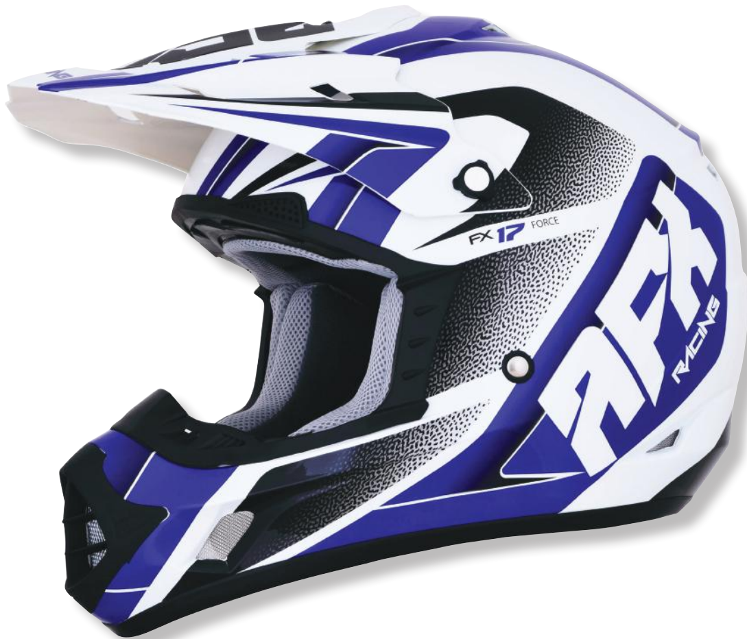
FX-17 FORCE PEARL WHITE / BLUE