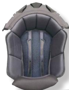
FX-14 COMFORT LINER