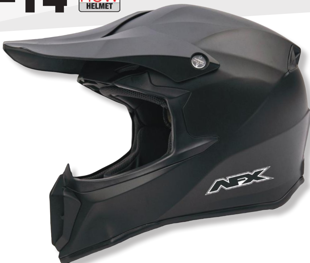
FX-14 SOLID MATTE BLACK