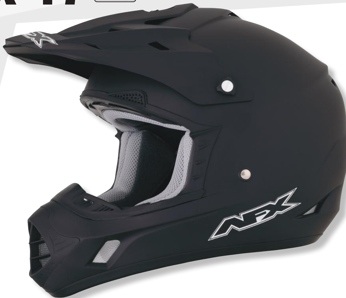
FX-17 SOLID FLAT BLACK