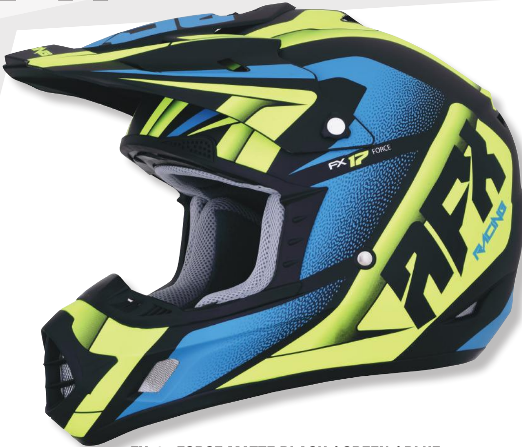
FX-17 FORCE MATTE BLACK / GREEN / BLUE