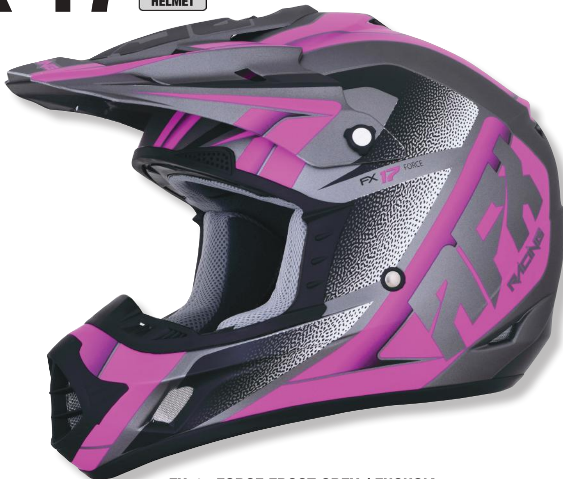
FX-17 FORCE FROST GREY / FUCHSIA