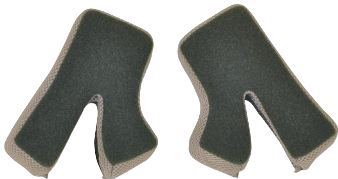
CHEEK PAD SET