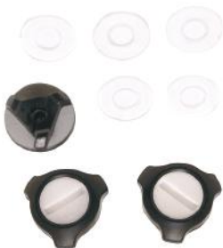
PEAK SCREW SET