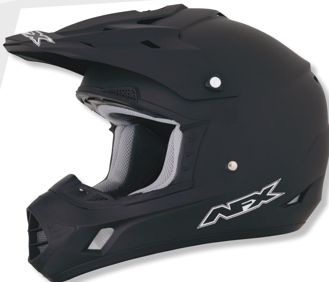
FX-17Y SOLID FLAT BLACK