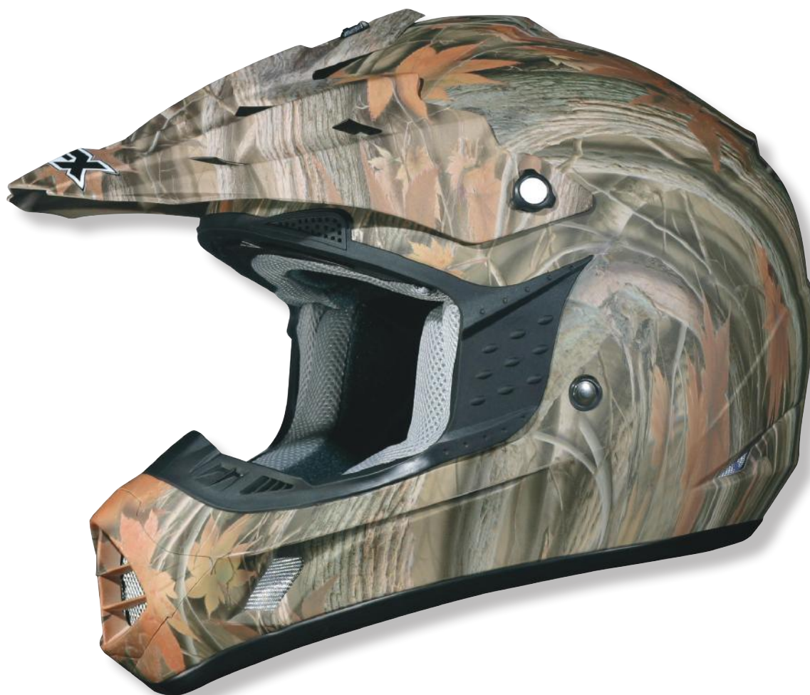
FX-17 WOOD CAMO