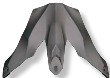
FX-14 PEAK MATTE BLACK PART NUMBER :0132-1465