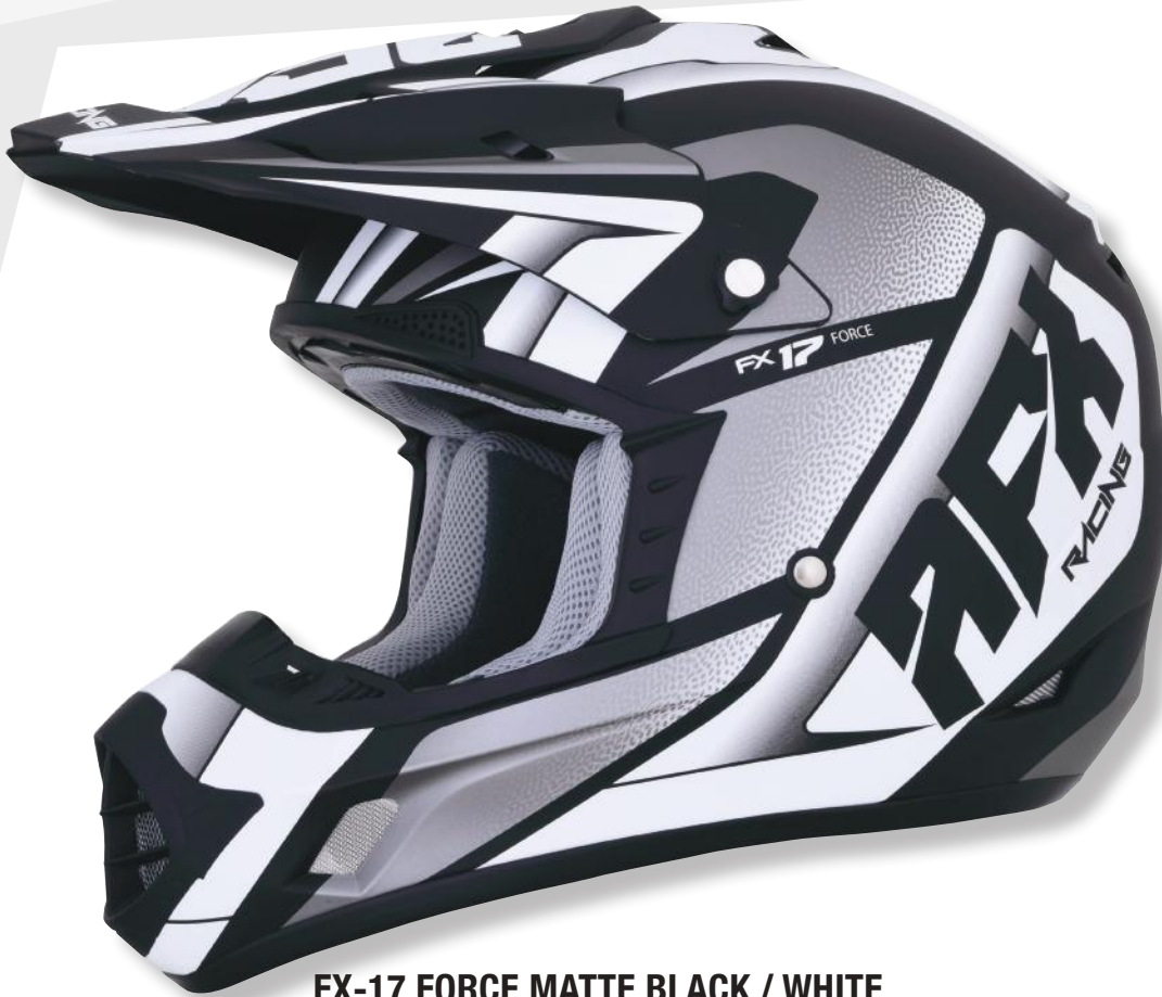
FX-17 FORCE MATTE BLACK / WHITE