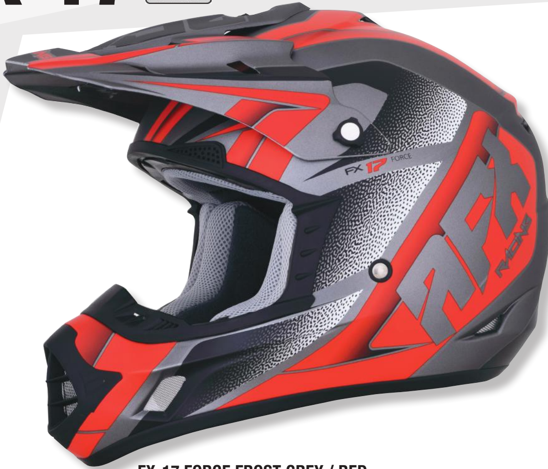
FX-17 FORCE FROST GREY / RED