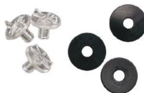
FX-14 SCREWS PEAK PART NUMBER :0132-1297