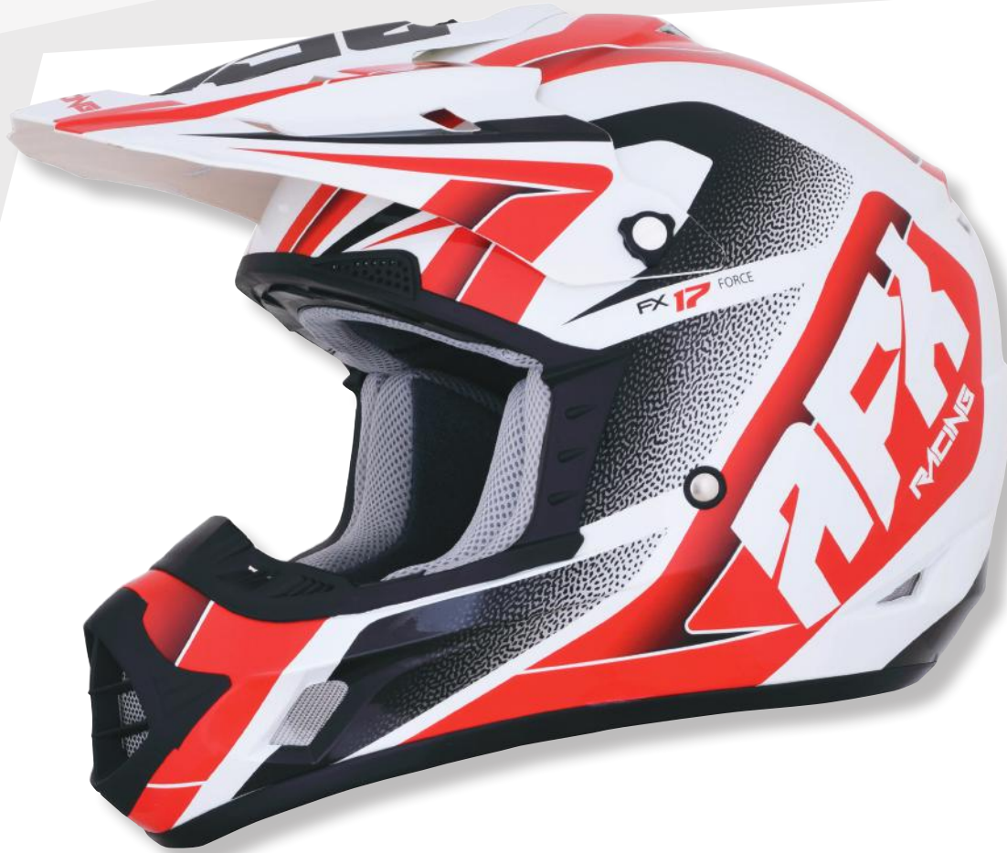
FX-17 FORCE PEARL WHITE / RED