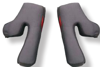
FX-14 CHEEK PADS