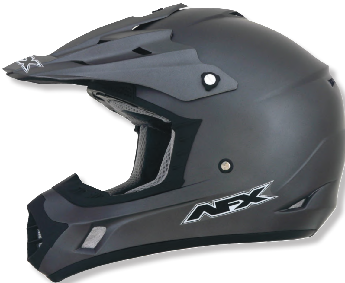
FX-17 SOLID FROST GREY